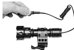
IR Illuminator with Picatinny mount and remote control